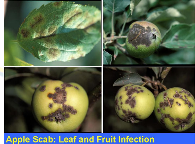
Apple Scab: Leaf and Fruit Infection

Symptoms: Young scab infections on leaves are characterized by velvety olive green lesions that often become necrotic in their centers as they age. Early season infections frequently occur on the lower leaf surface, but lesions can be found on the upper surface as well. Extensive infections can cause early defoliation that weakens the tree and often reduces return bloom for the next year's crop. Late season infections often occur on the underside terminal leaves after the final spray and before leaf fall and are often dark in appearance.